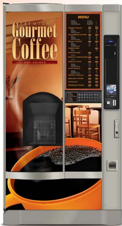
MODELS 673 FB, 675 FD, 677 FB w/Grinder

Hot Drink Center 2 features compelling and appetite-appealing graphics are highlighted by an attractive backlit display that calls out and complements the new and improved shadow box menu board, improving the overall coffee experience and environment.